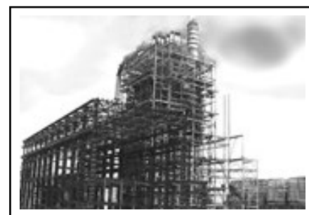
Civil & Structural Works at 1x500 MW Sanjay Gandhi Thermal Power Plant at BHEL Birsinghpur