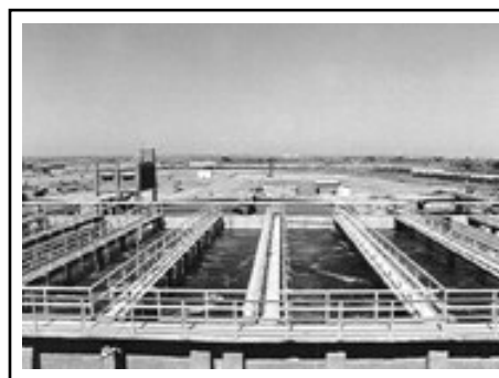
Effluent Treatment Plant at Jamnagar Petrochemical Project of Reliance Industries Ltd.