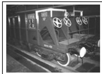
BOBYN Type Railway Wagon manufactured at Howrah Workshop

Although considerable improvement has been made with respect to the performance in the previous year, further enhancement in production could not be achieved mainly due to the following issues :-