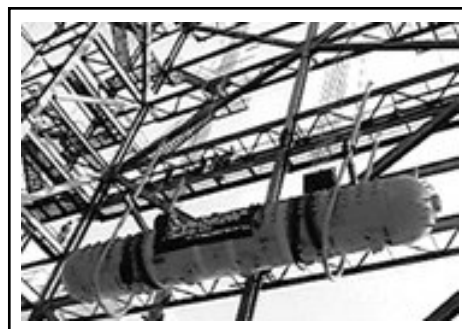
Erection, Testing and Commissioning of Boiler Main ( 130 MT at Elevation 56M ) at 1x210 MW Mejia TPS ( Unit- IV ) of DVC

Value of work done in the Project Division during the year is Rs. 588.35 crore as compared to Rs. 495.74 crore last year. Important projects which are successfully completed during the year include -