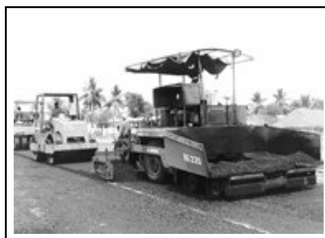
Paver Finisher with Sensor in operation for construction of NH- 9 over 48 KM from Nandigama to Vijayawada in Andhra Pradesh for NHAI

In compliance with the requirements of Section 217(1)(e) of the Companies Act, 1956 the particulars of Research and Development, Technology Absorption and Adaptation are appended in Annexure to the report (Form B).