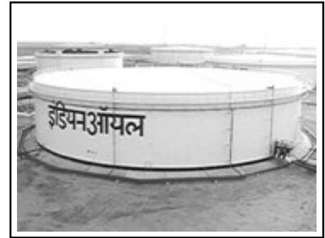
Cone Roof Product Storage Tank at Kandla F.S.T. for IOCL

The development of human resources is a dynamic part and parcel of Company's business strategy. Training and motivation of employees, identified as most effective means for human resource development, continues to be the driving source behind all HRD initiatives taken in the Company. Apart from the usual performance and potential appraisal systems, increased emphasis is being given to identify the specific areas of improvement in tune with ever evolving operational requirements of the Company, leading to a focused training plan. During the year 48 programmes have been conducted covering 97 employees.