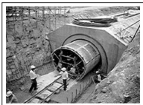
Upper Dam Diversion Culvert Works for Purulia Pumped Storage Project for Taisei Corporation

Despite severe competition mainly from Private Sector companies, the Company with its sustained efforts secured order worth Rs. 1103.03 crore during the year 2006-2007 compared to Rs. 708.88 crore in previous year.