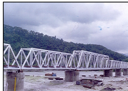
Regirdering Work in progress over River Diana For N.F. Railway