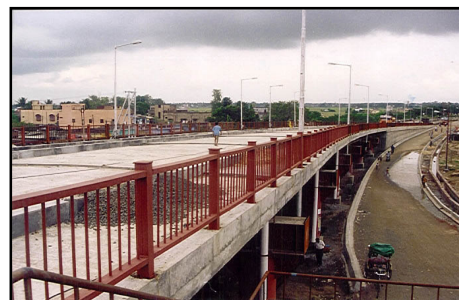
Construction of Flyover over NH-2 at Durgapur for National Highways Authority of India

The Company has already been awarded ISO:9001-2000 with respect to Tank Construction and Manufacture of Bailey Bridge and Wagons. The Surveillance Audit has been carried out successfully by External Auditor, M/s. DNV.