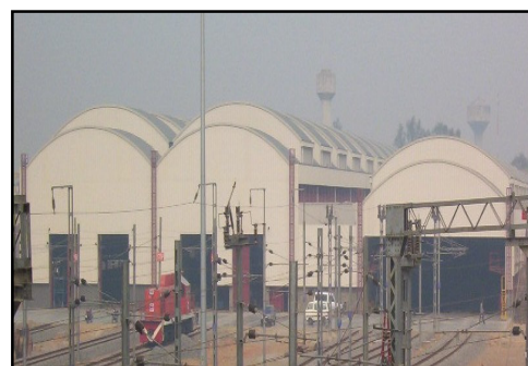
Workshop at Khyber Pass Depot of Delhi Metro Railway Corporation

The value of work done in the Project Division during the year is Rs. 433 Crore as compared to Rs. 372 Crore last year. Important projects which are successfully completed during the year include –