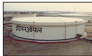
Cone Roof Tank at Kandla F.S.T. for IOCL