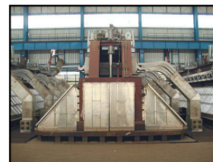
Finished POT Assembly for BALCO at Korba