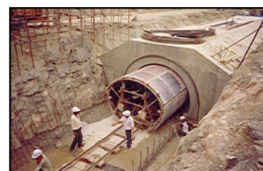
Upper Dam Diversion Culvert Works for Purulia Pumped Storage Project for Taisei at Purulia, W.B.