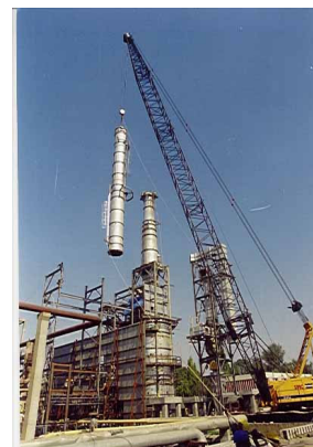
Erection of Stack at IOCL Gujarat Refinery During Shutdown