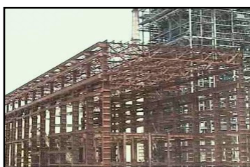
Structural Works for Sanjay Gandhi Thermal Power Plant at BHEL, Birsinghpur